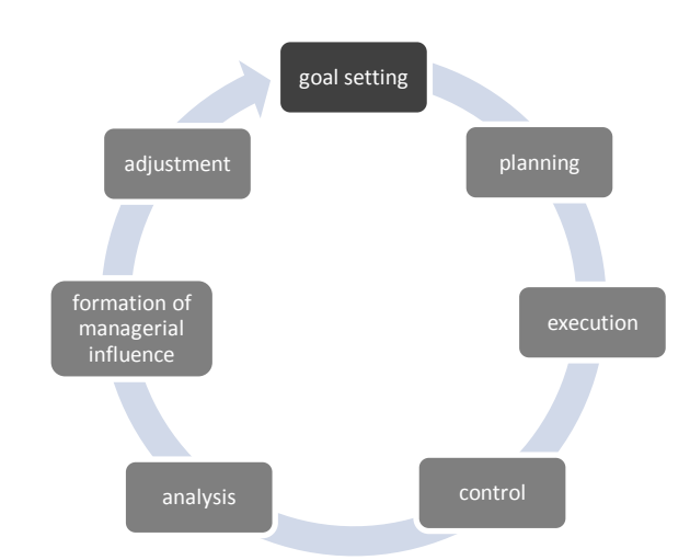
Fig.1. Scheme of control cycle (Intalev, Electronic Resource)

In this regard, a look at the investigated aspect of the INTALEV group of companies specializing in the development of its own software products and complex industry solutions deserves attention, which puts forward the idea of the expediency of using management cycles in the real activity of the company instead of the well-established conservative use of management functions. According to INTALEV, the management cycle (Fig. 1) is a closed chain representing the results of the execution of functions: decision making, organization of implementation, control over the implementation process and feedback to correct the decision or implementation process.